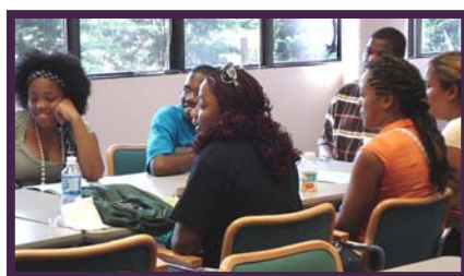
Scholars Summer Workshop